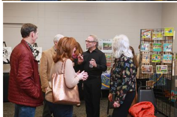
Images of the Louisville Orchestra / Art Show